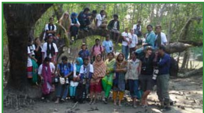
Participants in the mangroves

The participants in the workshop were mainly a mixture of undergraduates, MSc students, and lecturers and their passion for wildlife was evident. Some of them were already working on birds or the dolphins but they have a new-found enthusiasm for otters which they will carry into their work.