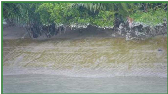
Signs of the oil spill

the small creeks, home to the otters. The oil spill had resulted from the collision of two ships in the main channel releasing about 350,000 litres of furnace oil. When we watched the otters feeding they were on banks of mangrove mud with many little red crabs and mudskippers - ideal prey. Now some of the creeks were covered in a fine film of oil and nothing moved - no crabs, no mudskippers.